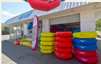
Located across from Bozeman High School on Main Street.